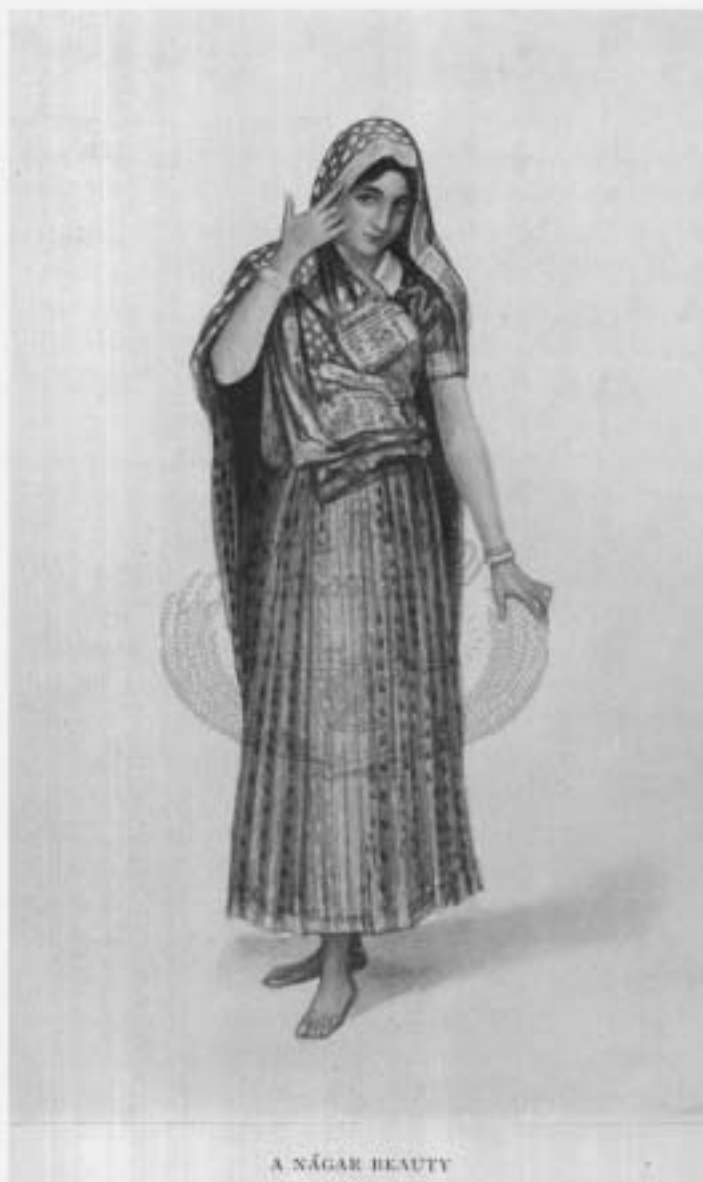
A NĀGAR BEAUTY